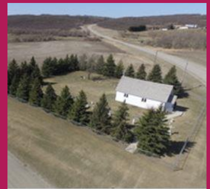
St. Luke's Pembina Crossing

Farm to Table: Urban/Rural Connection – Learn How Canola is Produced